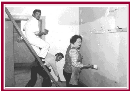
1976 Volunteers Painting the Theatre